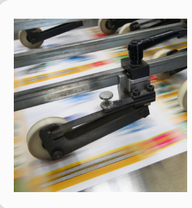
Trelleborg Coated Systems Leading global supplier of unique customer solutions for polymercoated fabrics deployed in a variety of industrial applications.