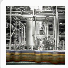
Trelleborg Industrial Solutions Market leader in such industrial application areas as hose systems, industrial antivibration solutions and selected industrial sealing systems.